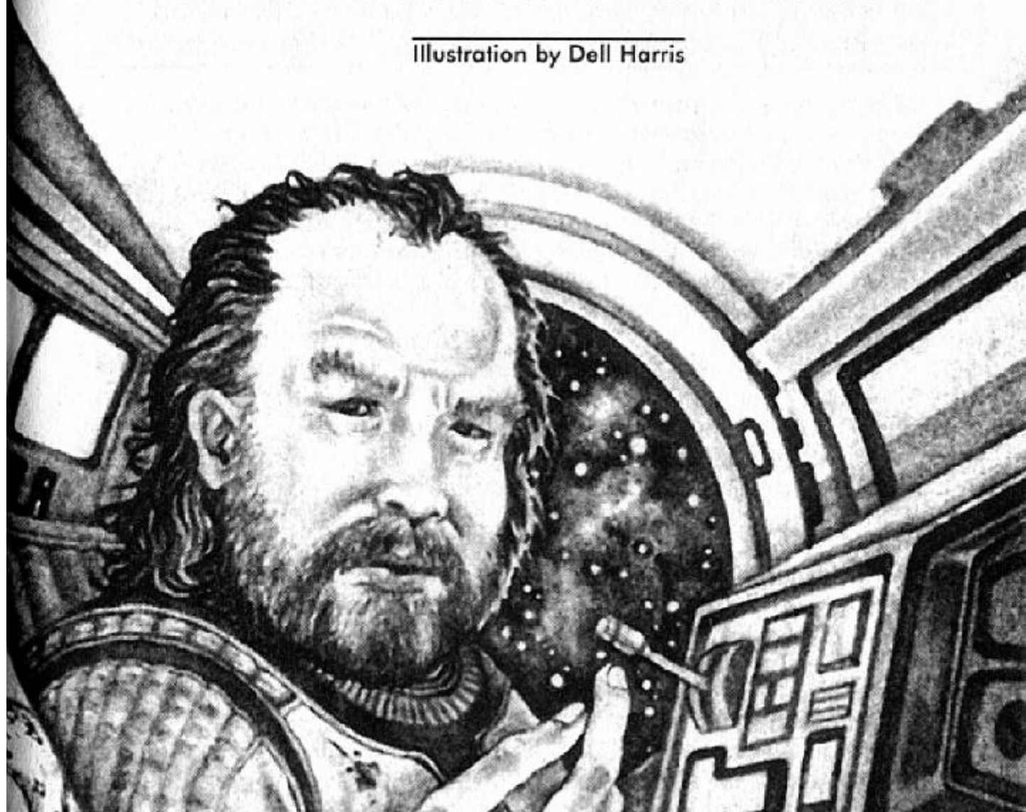
Illustration by Dell Harris